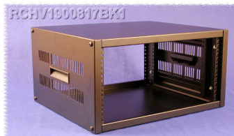
Hammond Multi-module cabinets 2,3,4, or 5 modules

Also available - Single Module Mobile Lab Cart – Call for details Additional mounting options are available from Hammondmfg.com